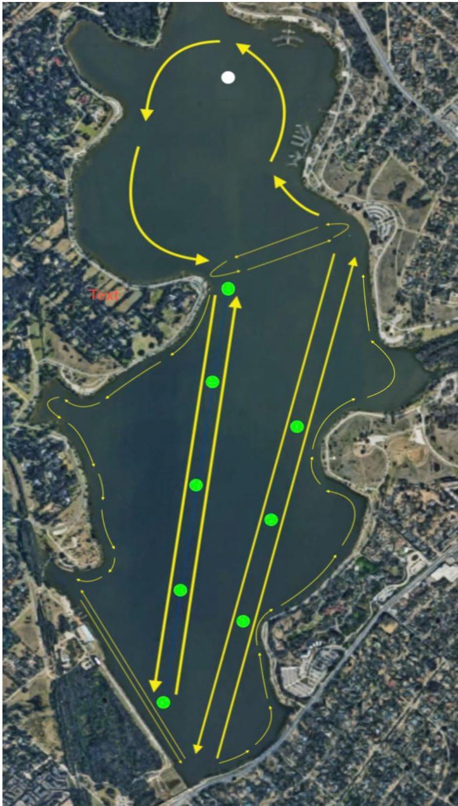
Overall Traffic Pattern